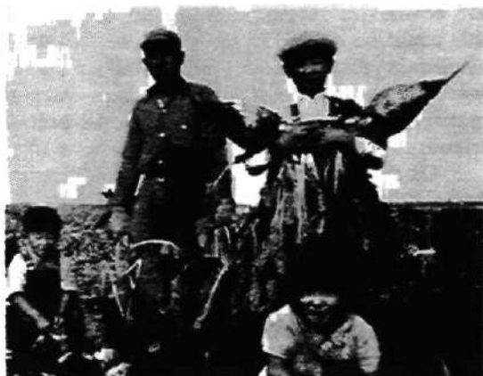
A Japanese family in the beetfields, 1945.

drove the last nails into the coffin of attempts to unionize Alberta's beet workers.