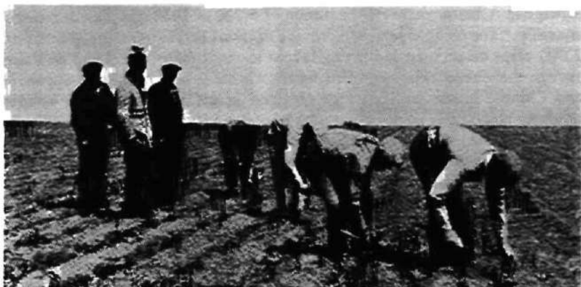
Thinning a large beet acreage, 1930's.