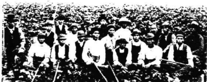
Japanese Contract Labourers of the Knight Sugar Co., 1904.

Thus the Knight Sugar Company was never able to obtain enough beets to operate at an efficient level, even with an attractive price of $5 a ton. Beet acreage in Alberta reached a maximum of 5,200 in 1908 and then decreased annually. 4 The company tried to provide its own beets by planting as many as 2,000 acres on its own and hiring labour to work them, but it had no more success than the local farmers. Few whites wanted to hoe sugar beets. Japanese and Chinese labour could not be obtained in sufficient quantities without arousing community opposition to the importation of Orientals. Indians were less productive, sometimes damaged plants at the critical thinning stage and could not be counted upon to remain on the job throughout the season. 5 When the twelve year tax exemption ended in 1914, the Knight Sugar Company's Board of Directors voted to cease operations, and the factory was dismantled and moved to the United States. 6