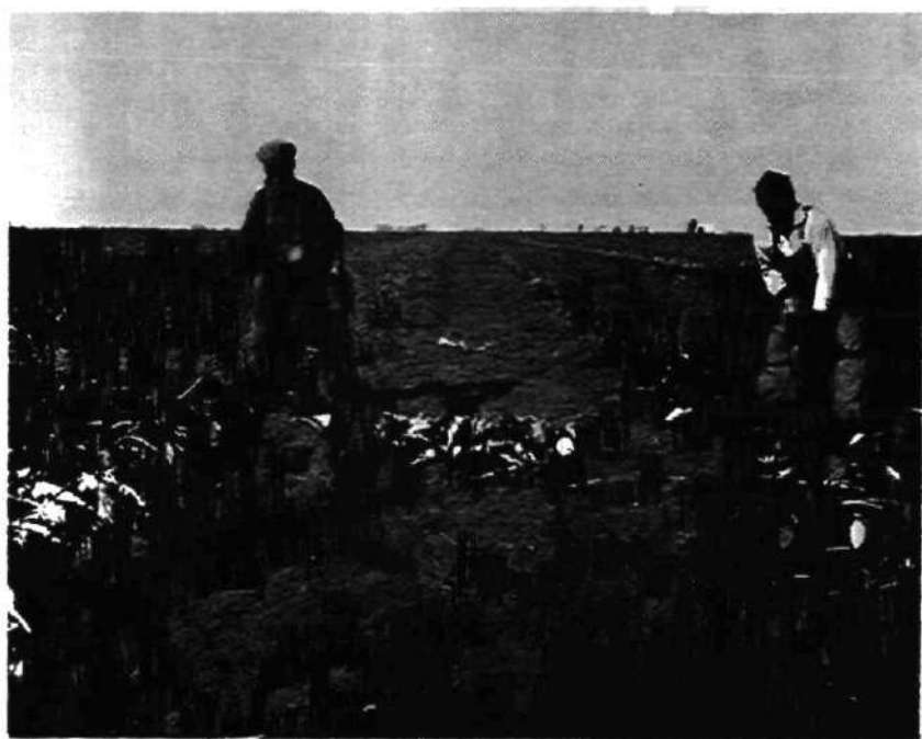
Harvesting sugar beets, 1930's.