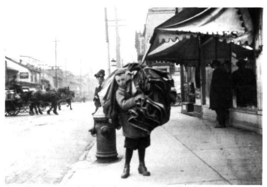
Boy with rough material on Queen Street, Toronto.

the sewing, and in a great many cases, one, two, three or more strangers, usually young women or girls, were brought from the neighbourhood and paid a small sum for their services by the week or piece."22 Like Wright before him, King discovered that private homes, not factories or workshops, exhibited the harshest working conditions. Children routinely assisted in the sewing process and worked as carters carrying material between home and supply houses. King also reported that home workers were required to supply their own thread, a cost which he claimed composed "a substantial fraction of the gross earnings received."23 Many shop workers brought unfinished material home at night and completed their work with the help of their families. King concluded: "It was pretty generally conceded that, except by thus working overtime, or by the profits made by the aid of hired help, there was very little to be earned by a week's work."24