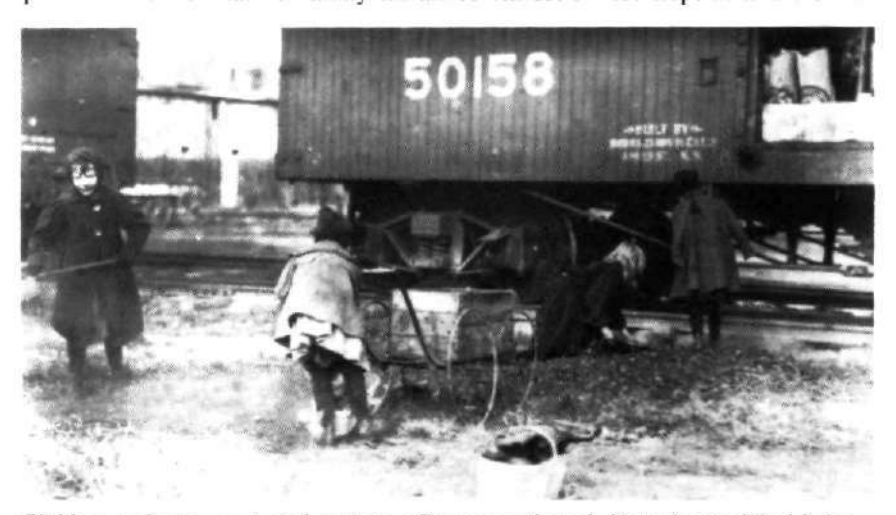
Children gathering coal cinders from a Toronto rail yard. Note the modified baby carriage.

The frequency and regularity with which working-class families called on their younger members to assist in a wide variety of domestic duties highlights the continuing importance of children as active contributors to the family economy. This practice also reveals that working-class families could not rely on industrial earnings alone to provide all the goods and services demanded by urban life. The entrance of mothers into the wage-earning work force undoubtedly disrupted traditional family relations. But the family responded rationally by shifting responsibilities to other members. Single-parent families adjusted in the same manner. Children's chores usually corresponded with a sexual division of labour, except in cases where this was impractical or impossible. Unfortunately, not all observers recognized the significance of youngsters' work in and around the home. Truant officer Wilkinson, for example, complained in 1873 that "in many instances children were kept at home for the