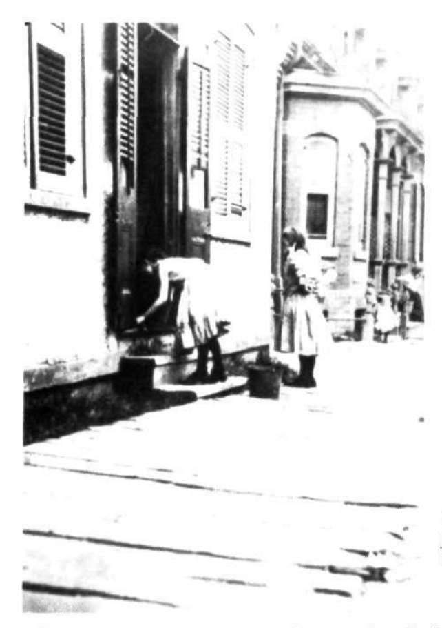
Young girls scrubbing front doorstep.

sell to neighbours or at the market for a small profit. In an age when sickness could spell disaster for a family, youngsters provided care for ill family members and sometimes offered themselves as substitute workers. It was also common for older children to assume the duties of a deceased parent, girls frequently taking up mother's responsibilities and boys stepping into father's shoes. On occasion, parents lent their children's services to neighbours in return for nominal remuneration or future favours. Although youngsters who worked in and around their homes did not normally encounter the dangers associated with industrial life, in at least one case a young Ottawa lad who was gathering wood chips outside of a lumber mill succumbed to his youthful curiosity and wandered into the plant only to meet his death on an unguarded mechanical saw."