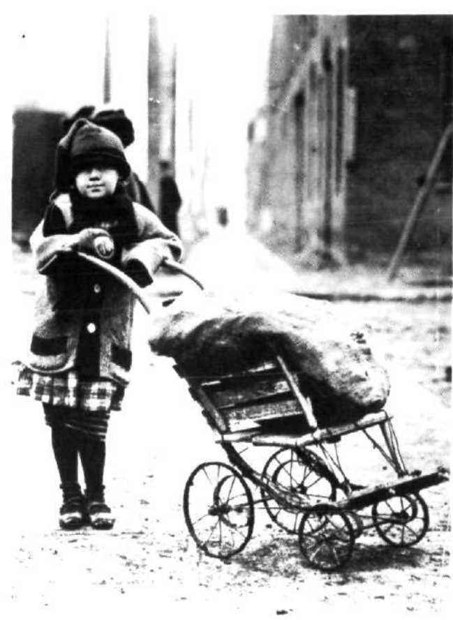
Bringing home the coal.

second and third wage-earners to keep themselves above the poverty line. In some cases, especially in families where children were too young for formal employment, economic need forced mothers to set aside their daytime domestic duties and take up employment outside the home. The introduction of machinery in sectors such as food processing and the textile industry created jobs for unskilled female labour, although it also depressed the general wage level and guaranteed that female earnings in particular would remain pitifully low. Such industries, along with retail stores, welcomed this cheap labour force with open arms. Wage-earning mothers, consequently, placed even greater housekeeping and other domestic responsibilities onto the shoulders of their children. Most importantly, mothers enlisted older children to babysit younger siblings in their absence. In cities where day nurseries were available, even the smallest cost proved prohibitive for many working-class families. These duties took on particular importance in households headed by single parents, male and female.