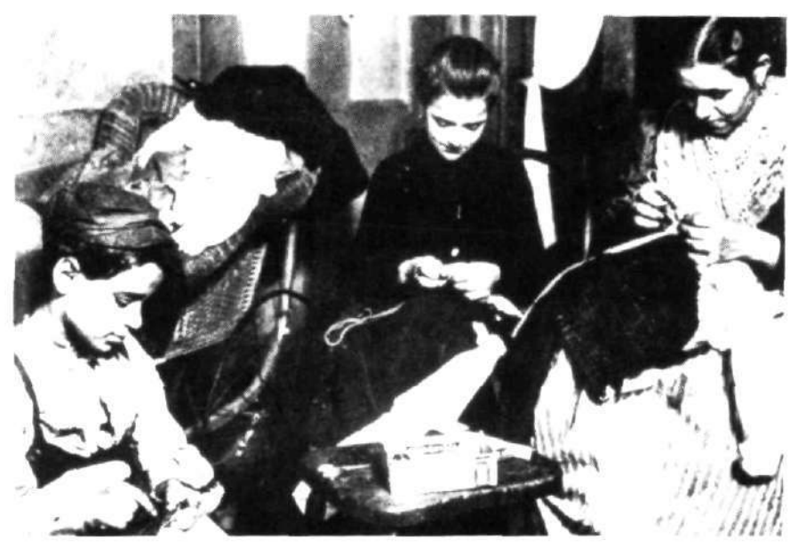
Sewing at home. Note strong family resemblance.

More than decade later, in 1882, a federal government inquiry studied the conditions of 324 married female workers. The investigation revealed that 272 women performed most of their work in their own homes. The women