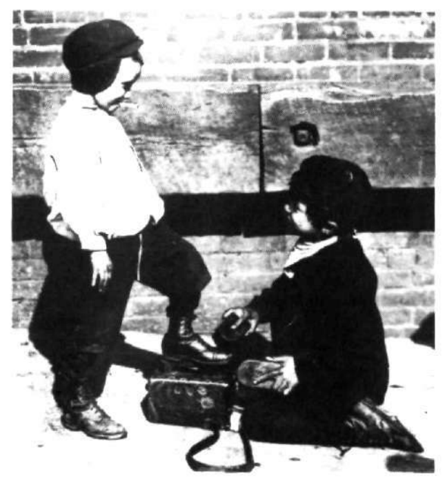
Two Toronto bootblacks demonstrate their trade.

Reaching beyond the perimeters of the home, many working-class children added to the family coffers through their participation in a variety of street trades. Nineteenth-century families immensely enjoyed socializing in public, and downtown streets always bristled with activity and excitement.28 A police survey of 1887 uncovered approximately 700 youngsters, the vast majority of them boys, who regularly performed, polished shoes, or sold newspapers, pencils, shoelaces, fruit, or other small wares on the streets of Toronto.29