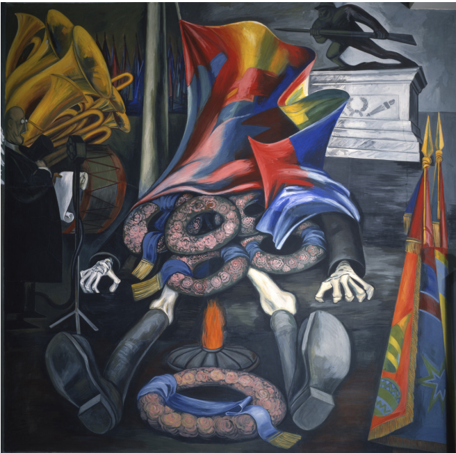
Plate 6: José Clemente Orozco, Epic of American Civilization: Modern Human Sacrifice (1934) in situ , Baker Library.

Commissioned by the Trustees of Dartmouth College, Hanover, New Hampshire.