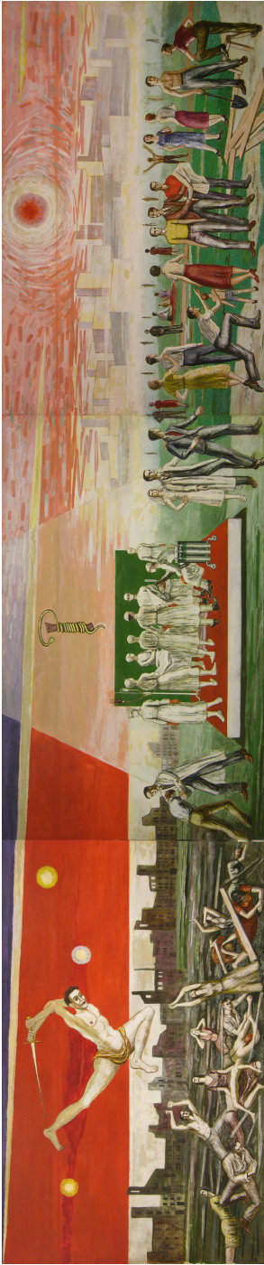
Plate 3: Miller Brittain, The Place of Healing in the Transformation from War to Peace (1954), 156 x 729 cm. Collection of Horizon Health Network, reproduced with the permission of the estate of Miller Gore Brittain.