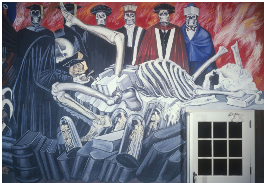
Plate 7: José Clemente Orozco, Epic of American Civilization: Gods of the Modern World (1934), in situ Baker Library. Commissioned by the Trustees of Dartmouth College, Hanover, New Hampshire.