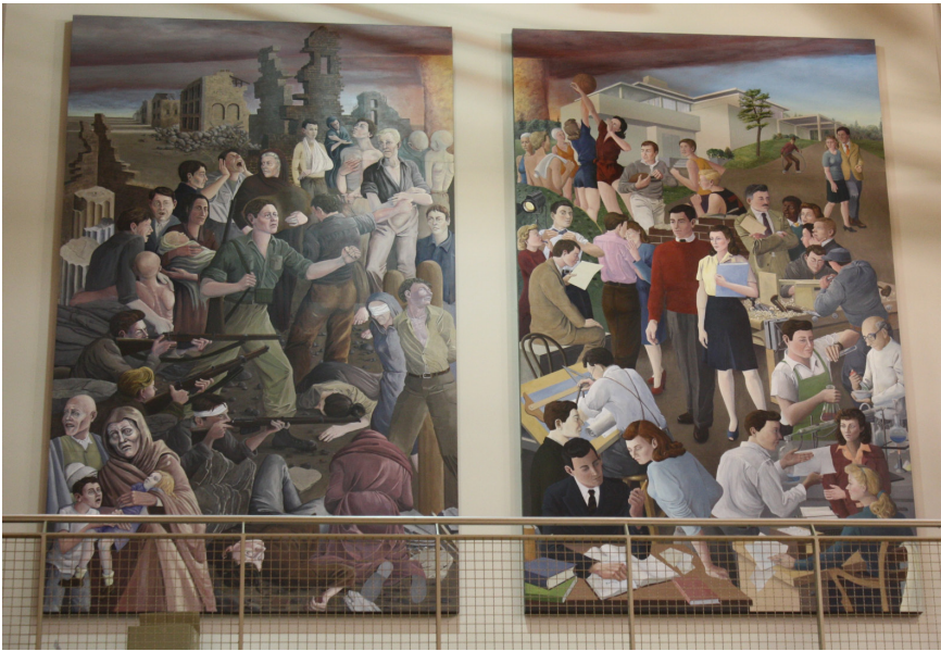
Plate 1: Re-created version of Fred Ross, Destruction of the World Through War and Rebuilding the World Through Education (2011) in situ The Currie Center, University of New Brunswick.