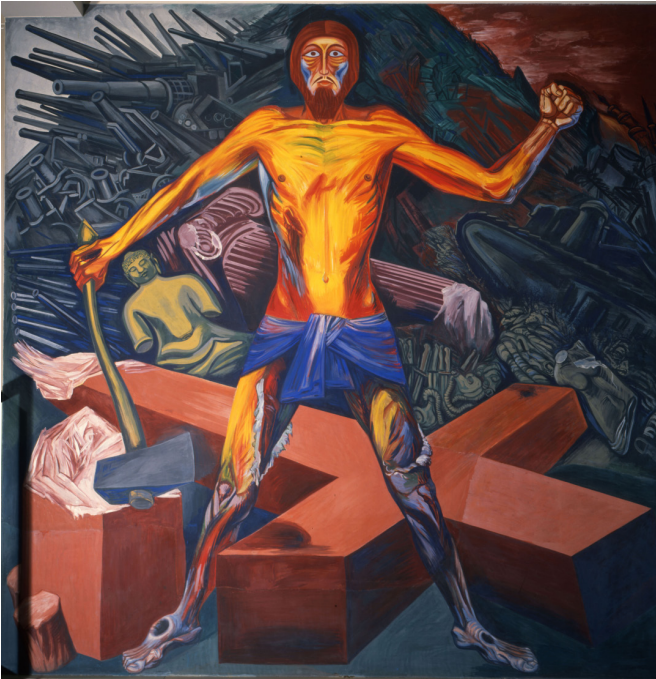
Plate 5: José Clemente Orozco, Epic of American Civilization: Modern Migration of the Spirit (1934) in situ , Baker Library.

Commissioned by the Trustees of Dartmouth College, Hanover, New Hampshire.