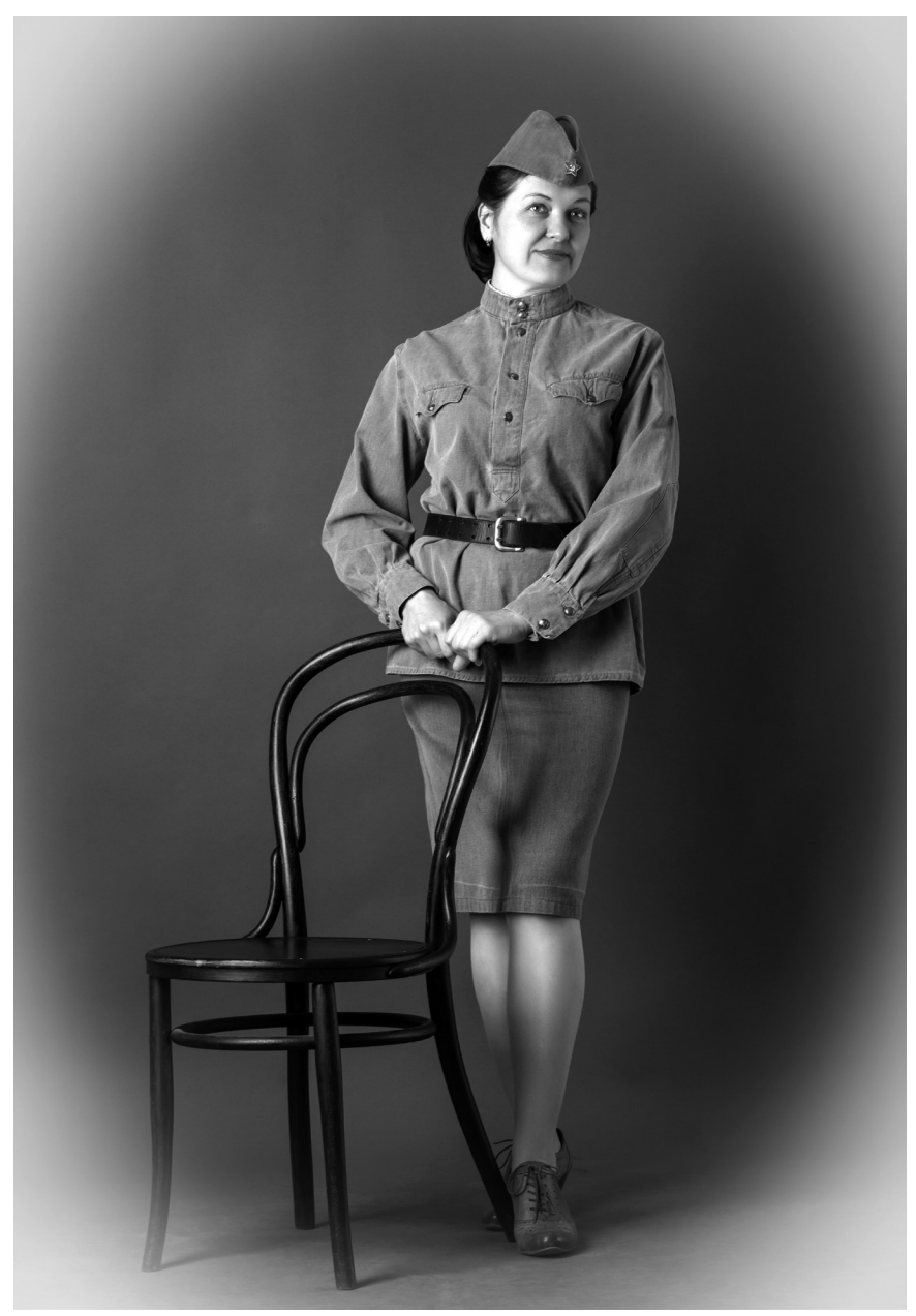
The presence of women in the military, and in many other areas of society outside of the home, came as a shock to many. Although this image came from outside Canada, similar images existed in Canada, and images like this one had a profound influence on Canadians.