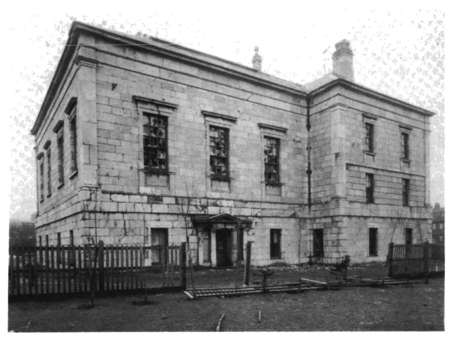
Colonial Building Riot. Circa 1932.

The violence of early April had serious repercussions. Immediately, the Government decided to expand the police force in order to strengthen its ability to maintain law and order. An auxiliary police force was also raised. But the incident also led to the government's demise. No longer able to control the situation, and with his support melting away, Squires had little choice but to call an election. The breakdown of law and order was further evidence that his government could govern no longer.