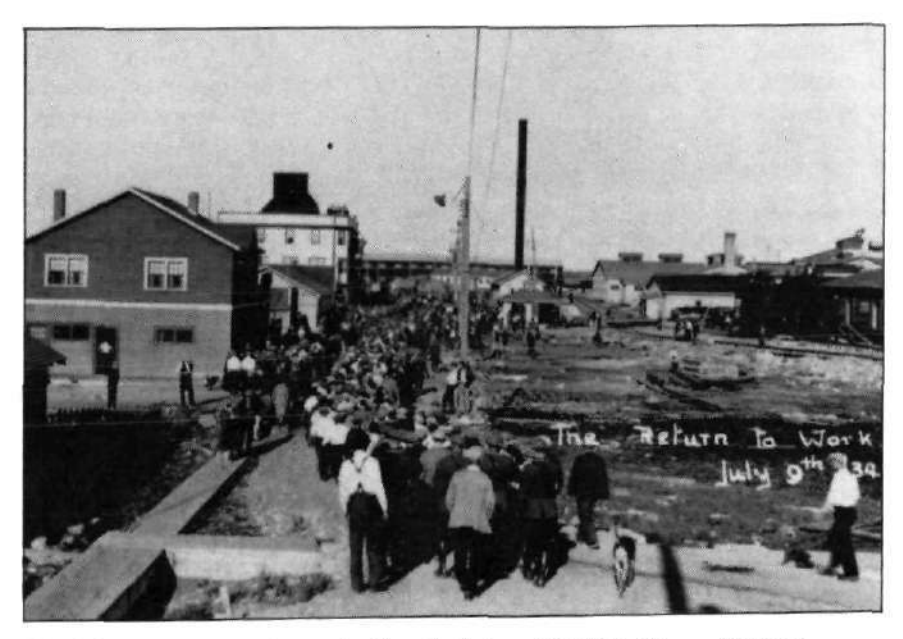
The 9 July return to work march. Note the helmeted RCMP officers.

On 14 July, the strike committee finally succumbed to the inevitable and voted 201 to 18 in favour of ending the strike. 116 In a last ditch effort to prevent discrimination against union members, the committee addressed a telegram to the Department of Labour asking for government arbitration. Complaining that 107 men had been discriminated against, the local branch of the MWUC requested the establishment of a Board of Arbitration to investigate miners' claims. 117 The Deputy Minister of Labour replied that it was impossible to set up a Board of Arbitration because the Industrial Disputes Investigation Act clearly did not apply to men who were no longer in the employ of the company. 118 With its leaders awaiting trial, its forces cut down by more than 75 per cent, the mine in operation, and the refusal of government arbitration, the local branch of the MWUC had its last hope rejected.