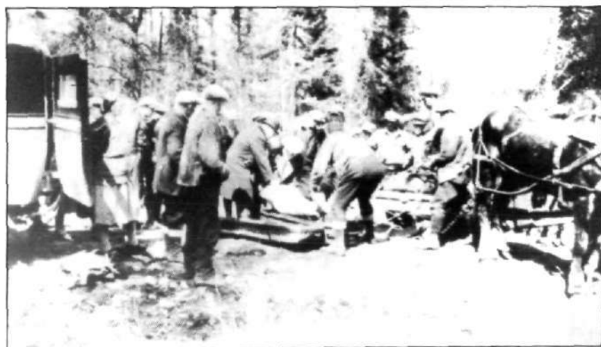
The body of Voutilainen transferred from horse sled to motorcar on Onion Lake Road.