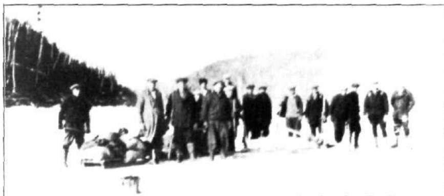
Search party of unionists on Onion Lake.

While the search party went looking for Rosvall and Voutilainen, the union also submitted a story of their disappearance to the local paper. This time they