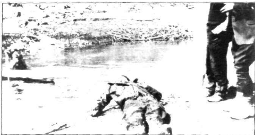
Body of Rosvall as found on the bank of the creek.