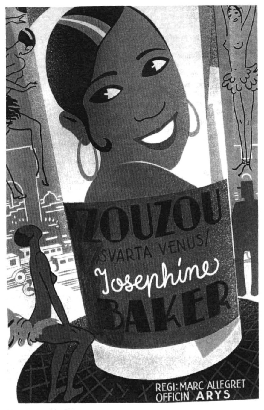
Figure 1: Josephine Baker