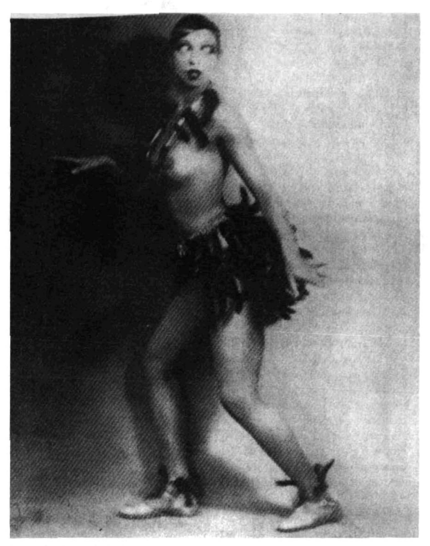
Figure 1a: Josephine Baker

later appeared in Vancouver in the 1950s. Cast in the show, "La Revue Negre" as a "tribal, uncivilized savage" from a prehistoric era, hence consigned to "anarchronistic space," Baker was rendered intelligible and digestible to white Parisian voyeurs. A Narrating the fantasy of the jungle bunny — the oversexed object of both white European fascination and repulsion — she danced in banana skirt and