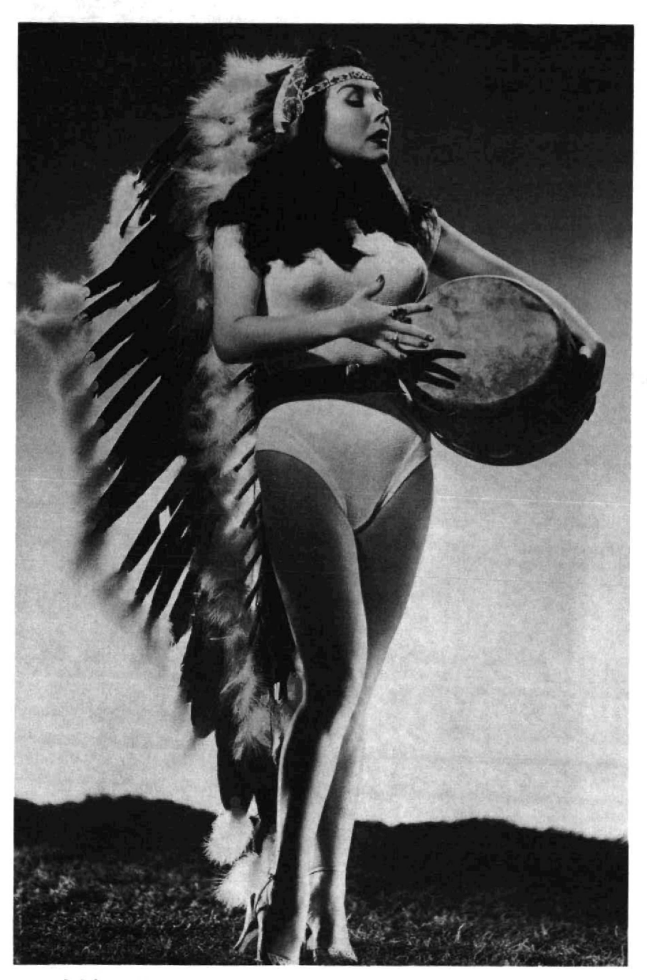
Figure 2: Princess Do May