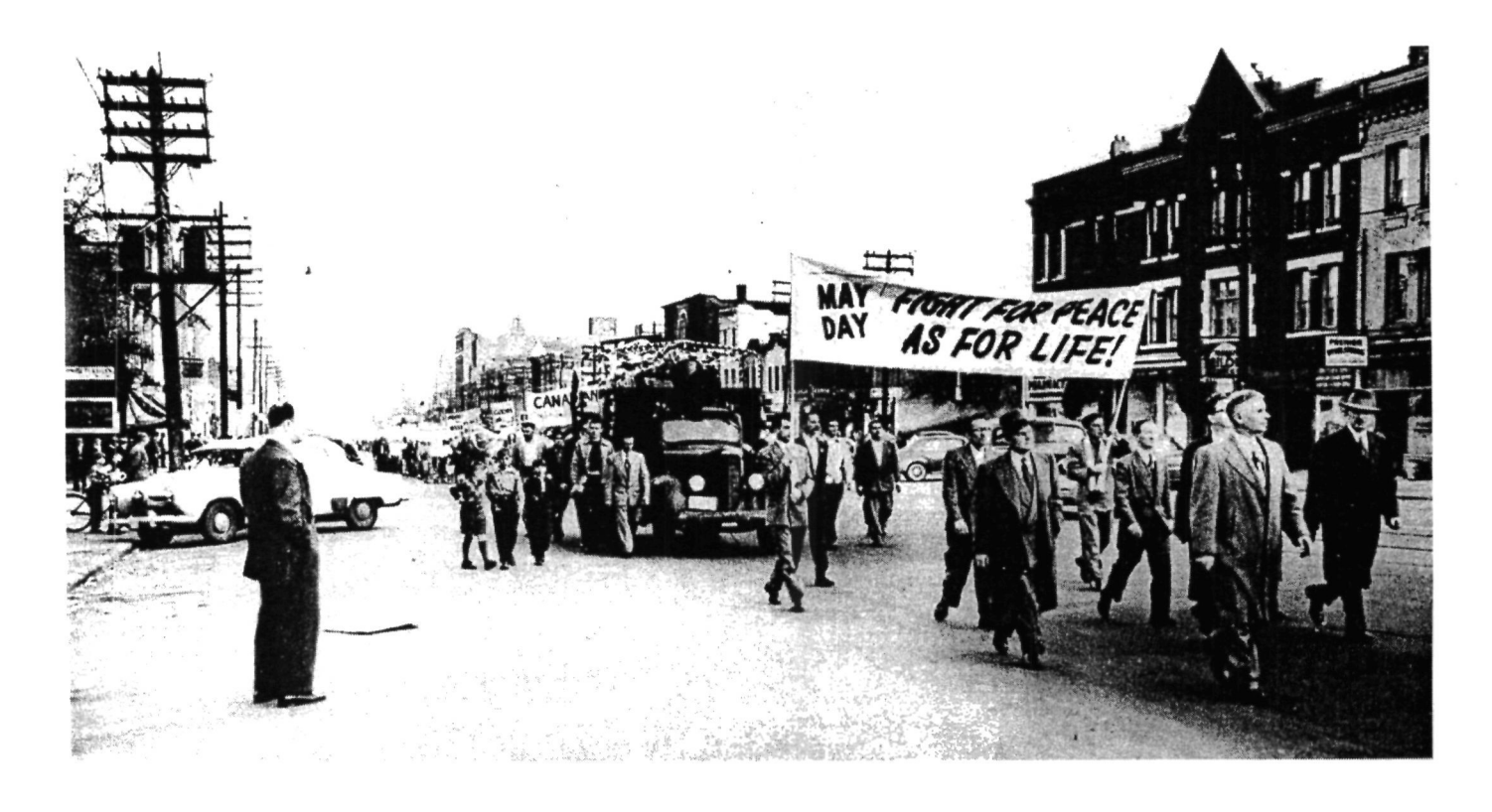
Figure 2. "May Day Parade, c. 1951." As found in Rosemary Dunegan, Spadina Avenue (Toronto 1985), 147.