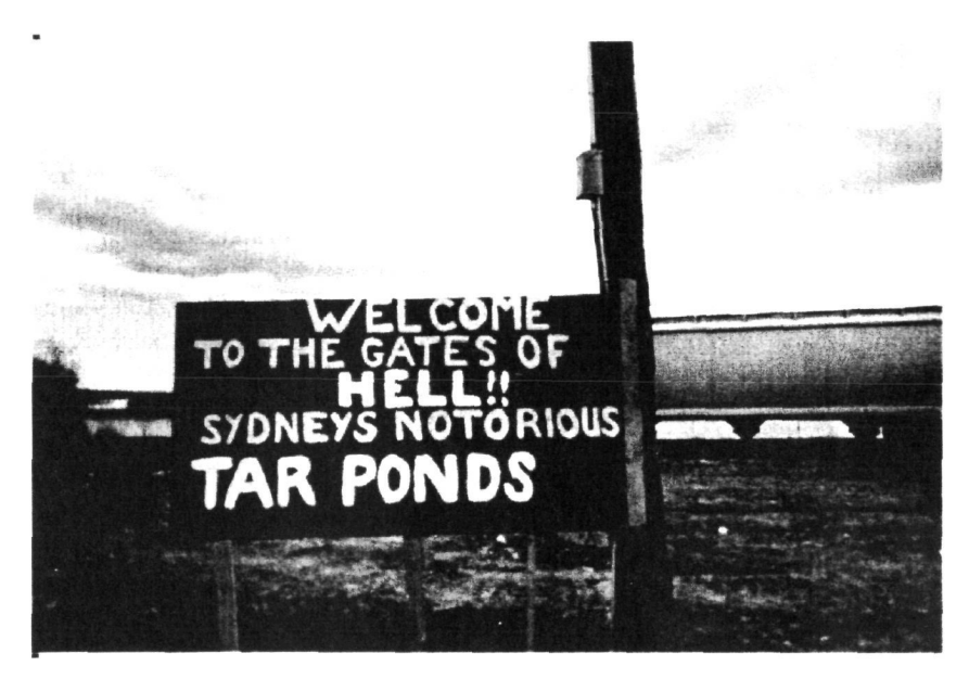
Figure 2: Waiting for the big dig: Intercolonial Street, May 2002.