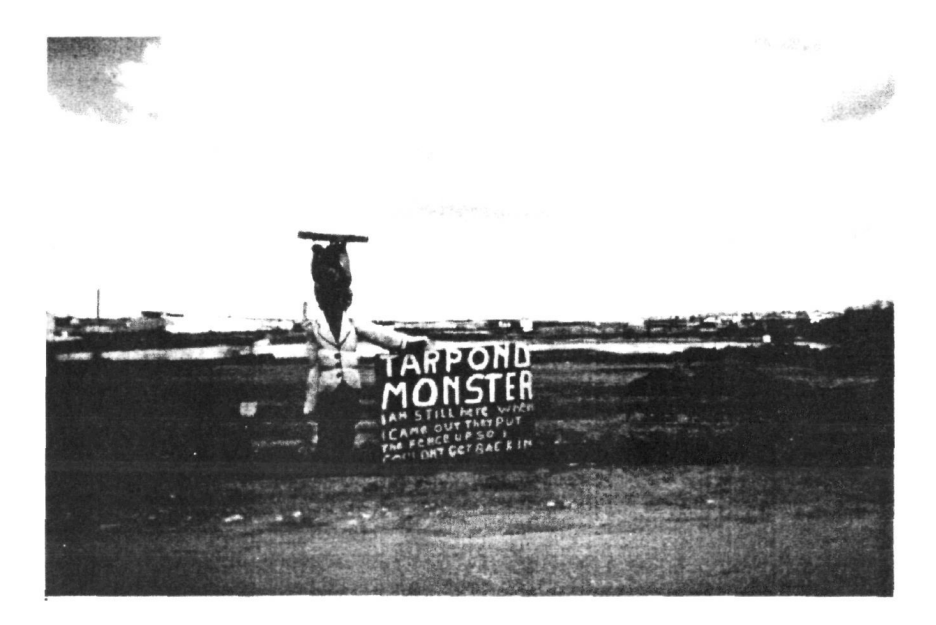
Figure 3: Paradise lost: "Tar Pond Monster," Intercolonial Street, May 2002.