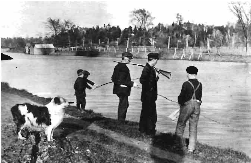
Figure 6. Pot Hunters at the Canal basin, Dundas. Using shotguns and homemade fishing poles to bag their catches, working men and their families of the boathouse colony survived on the plentiful game in the area until the designation of Cootes Paradise as a bird and wild-life sanctuary in 1927.

nocuous activities for kids of the area. “It seems to simply swarm with children,” a reporter from the Herald noted approvingly in 1924, at a time when Hamilton, like many other urban places throughout the country, wrestled with the problem of determining what sorts of recreations were morally appropriate for the city’s youth. Recreational programs sponsored by the parks board aimed to get kids off local street corners and into socially-sanctioned activities on supervised grounds. The area provided “a great natural playground” for them. The Herald argued that overall, kids living in the boathouses did not do all that badly by their unsupervised surroundings. For example, they fared quite well when it came to nautical pursuits, and they swam far away from Hamilton’s dangerous industrial waterfront and its busy wharves that so concerned city officials. 34 Clad in makeshift bathing suits (though more often au naturel ), they took to the water at a very young age. Many were said to be experts in swimming back and forth between the canal and Carroll’s Point on the north shore. This activity helped certain boys on to victory in Hamilton’s annual Playground Association Swimming Championships. Best of all, the high level