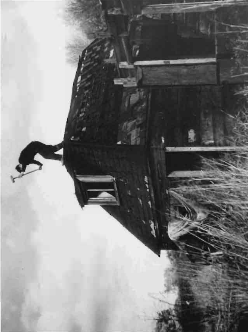
Figure 12. Demolishing a Boathouse.