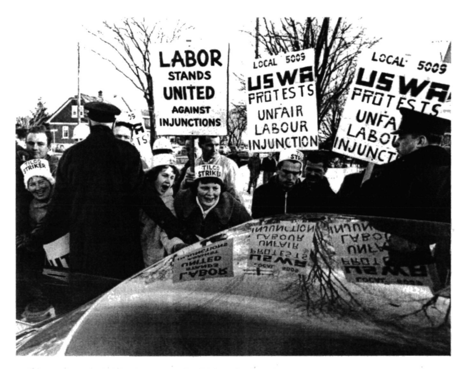
Demonstrations, 23 and 24 February 1966. Photo Courtesy of York University Archives, Toronto Telegram Photograph collection, ASC Neg. Number 1857.

more militant unionists who perceived it to be the only way to effect a meaningful picket line.<sup>43</sup>