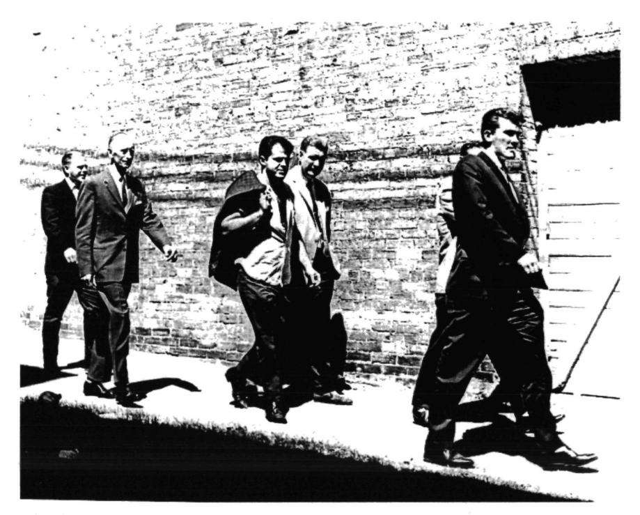
Men going to jail.

to give up, by April, in order to just return the women to work and keep a union alive. Skurjat's letter of 28 April asking to meet with Pammett concentrated only on slowly rehiring the women, having dues check off, and keeping the union the bargaining agent. Pammett offered to take five strikers back, though he would not name which ones. It is hard to imagine a less accommodating position; if the union acquiesced, it was tantamount to self destruction.