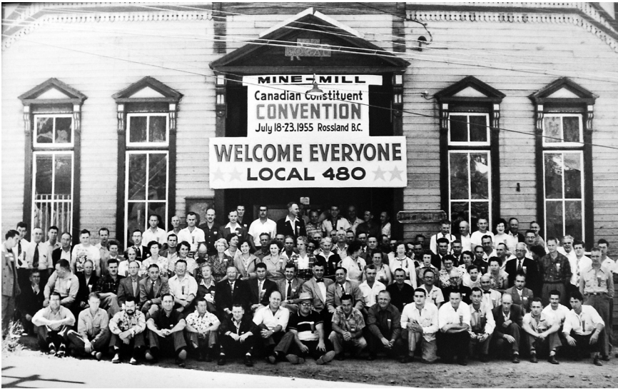
Local 480 hosted the founding convention of Mine-Mill Canada in the historic Rosland Miners' Union Hall, built by Local 38 of the Western Federation of Miners, Mine-Mill's predecessor, in 1898.