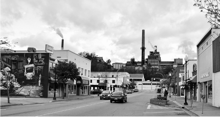
Trail today with Cominco smelter overlooking the city. Mural (left) shows lead furnaces where many workers suffered industrial diseases such as lead poisoning.